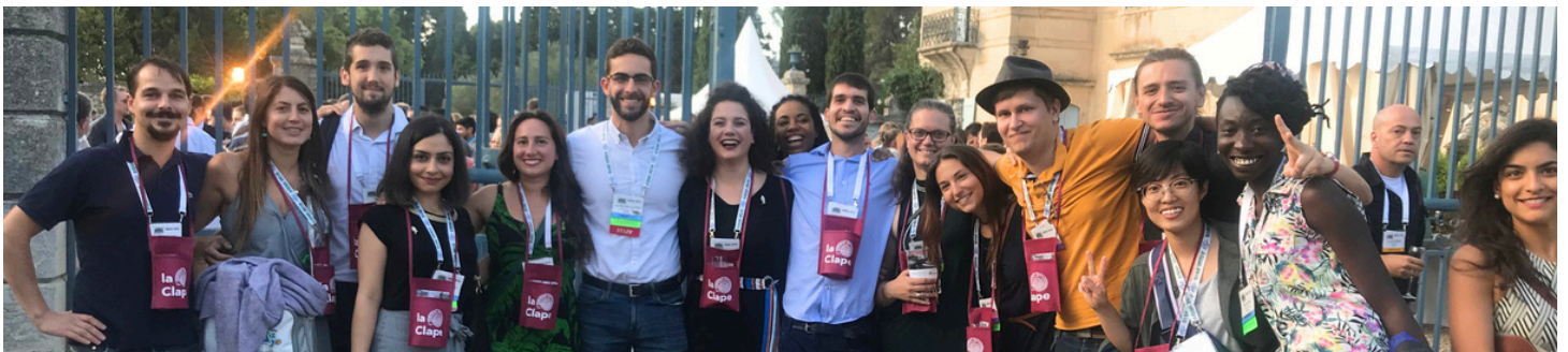
Student Helpers during AQUA 2018 in Montpellier, France