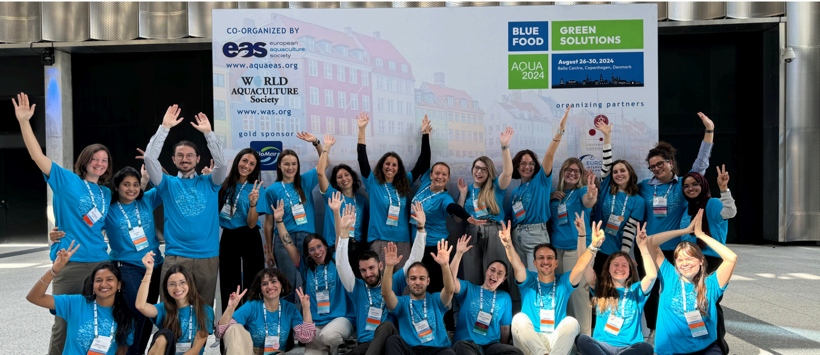
Representatives of the European Aquaculture Society Student Group at AQUA 2024 in Copenhagen, Denmark.

As a student helper, your contribution is vital to the smooth running of the event.