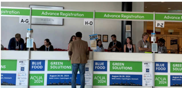
Student helpers at the Advance Registration desk during AQUA 2024 in Copenhagen, Denmark.