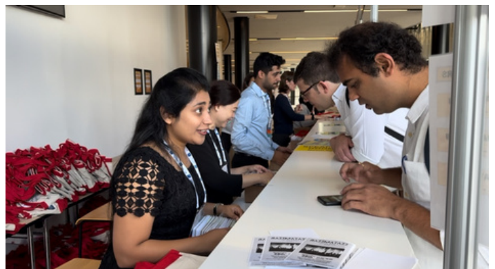
Registration desk at AQUA 2024 in Copenhagen, Denmark.