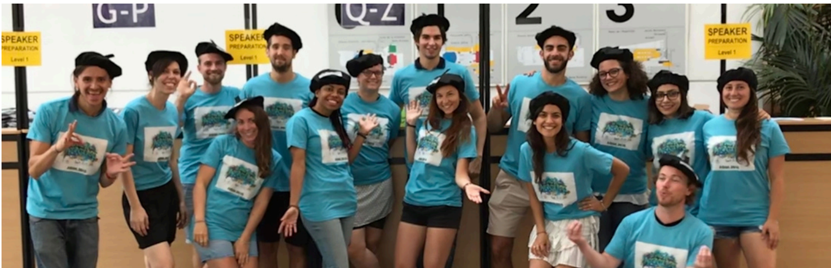
Student Helpers during AQUA 2018 in Montpellier, France