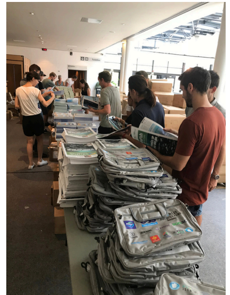
Photos of the bag stuffing at AQUA 2018 in Montpellier, France.