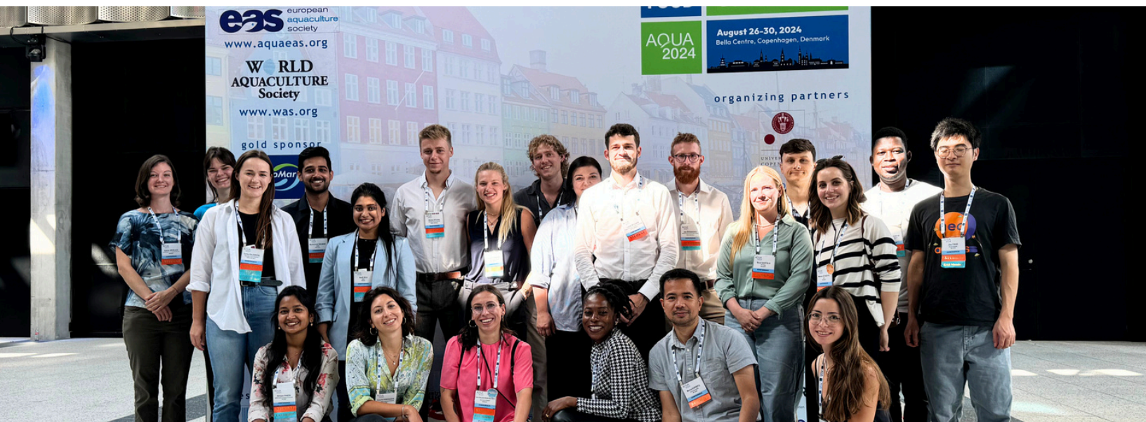
Student helpers during AQUA 2024 in Copenhagen, Denmark.